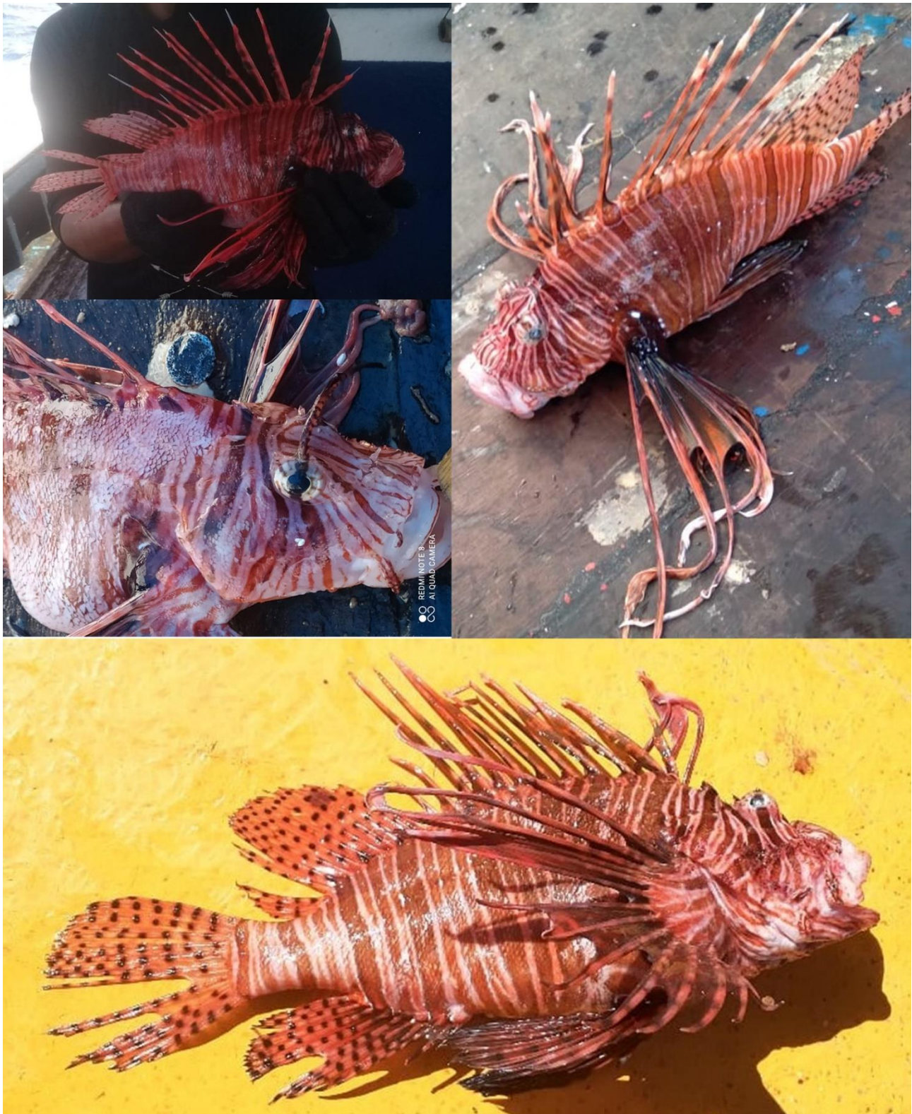
Figure 2. Red lionfish Pterois volitans (Linnaeus, 1758) caught at the Great Amazon Reef System, State of Pará, Brazil.