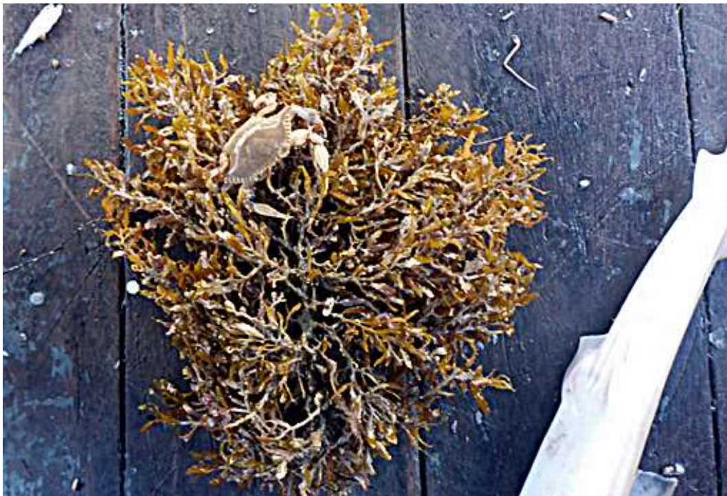
Figure 1. Clump of Sargassum spp. (collected in situ ) acting in the transport of marine fauna (raft drifting) along the Atlantic Ocean. Highlighting the swimming crab Achelous sp. De Haan, 1833 being transported associated with the clump of algae.

Macroalgae blooms are becoming a problem in Atlantic regions, especially in northern Brazil and the Caribbean Sea, where their high density affects fishing activities and ship traffic. These macroalgae also facilitate the active transport of species, called “raft drifting” (e.g. sponges, corals, bryozoans, molluscs, echinoderms, crustaceans and fish) (see Figure 1 for example), beyond their respective biogeographical limits, creating a pathway for the introduction of invasive species into different ecosystems (Niermann, 1986; Moreira & Alfonso, 2013; Wang et al., 2019).