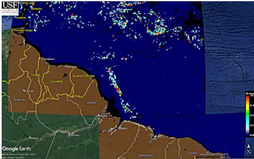
Figure 2. Map of the Amazon Continental Shelf (ACS), showing the large masses of floating algae ( Sargassum spp.), between the states of Pará and Amapá. Scale = Red points (high densities) and Blue points (low densities).

pelagic algae occurring in fishing areas have negative impacts due to their heavy densification, which may cause boats to become entangled with the algae on the propellers, nets (including trawl nets), hooks, longline and winches.