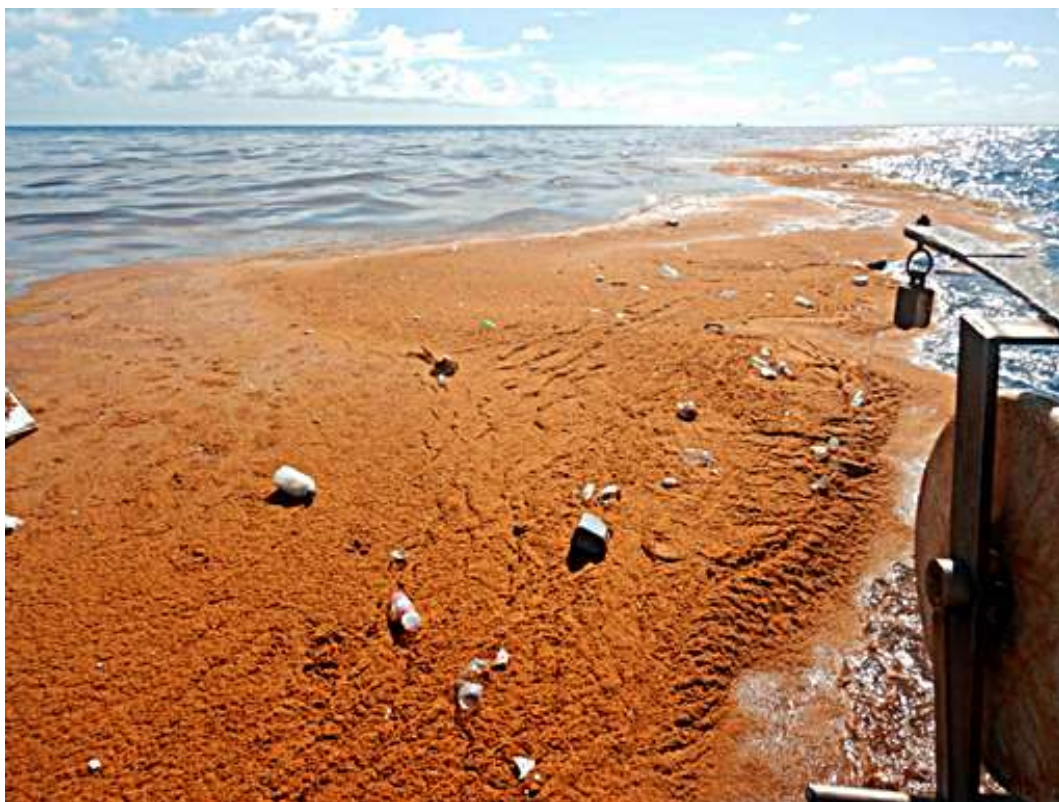
Figure 3. Observation of a large clump of algae (~2 km) in the state of Amapá, carrying marine litter from fishing activities between the northeastern and northern regions of Brazil.